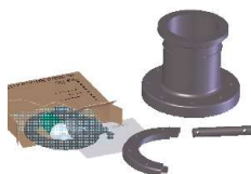
United F-06 "Fireflo" Hydrant Extension Kits